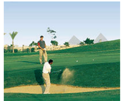
Hilton Pyramids Golf Resort, Cairo

Le Meridien Pyramids Hotel is built 1992 and remodeled in 2001. Cairo Le Meridien Pyramids Hotel is a modern luxury hotel providing one of the most spectacular settings for any kind of visit. With the largest number of rooms in the Pyramids Area, Le Meridien Cairo Hotel provides an ideal accommodation for the business and leisure traveller. It offers a variety of international restaurants to choose from and live entertainment every evening. Le Meridien Pyramids Hotel has an unusually elegant European style with a French Accent that incorporates the individual character and flair of the local culture, making your journey worthwhile and your stay a pleasure.