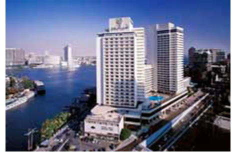
Sheraton Cairo Hotel

The Sheraton Cairo Hotel Tower Casino is built in 1970 and remodeled in 2001. This Cairo hotel is luxurious deluxe hotel facing the glorious River Nile between city center and Pyramids. It is first Sheraton Hotel in Egypt. Sheraton Cairo Hotel is ideally located on the West Bank of the River Nile within a walking distance from the Cairo Opera House, sophisticated shopping centers and the Egyptian Museum. Sheraton Cairo Hotel Tower Casino is also just 15 minutes away from the Railway Station.