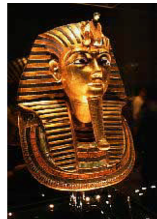
Funerary Mask Of Tutankhamun

The regularity and richness of the annual Nile River flood, coupled with semi-isolation provided by deserts to the east and west, allowed for the development of one of the world's great civilizations. A unified kingdom arose circa 3200 B.C. and a series of dynasties ruled in Egypt for the next three millennia. Following the completion of the Suez Canal in 1869, Egypt once became an important world transportation hub. Nominally independent from the UK in 1922, Egypt acquired full sovereignty following the World War II.