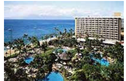
Westin Maui Resort & Spa