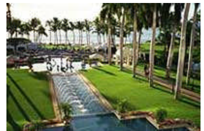
Grand Wailea Resort & Spa