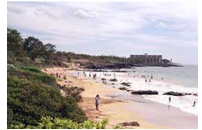
Kamaole Beach Park III, South Maui

Besides miles of sand beaches, Maui Island has many parks and gardens. Haleakala is one of best-known mountains in the world. With 10,023-foot summit, Haleakala dormant volcano mountain is the location of the Science City which provides astronomy research and education.