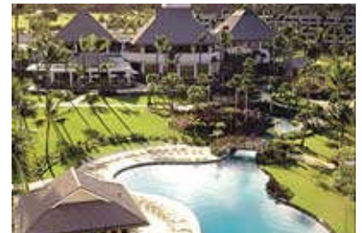
Sheraton Maui Resort Hotel

Although Maui is located in tropical zone but the climate varies with average temperatures from 72°F to 79°F. It is perfect for outdoor sports, including golfing, tennis, hiking, surfing and other water sports.