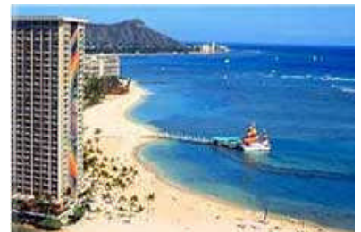
Hilton Hawaiian Village Beach Resort

The Turtle Bay Resort Hotel is located on the North Shore of Oahu, 45 minutes from Honolulu Airport. The resort features two lushly landscaped pools, two championship golf courses, ten tennis courts, horse back riding, hiking and mountain bike trails, world-class dining and shopping.