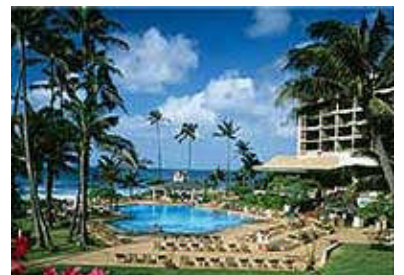
Turtle Bay Resort Hotel