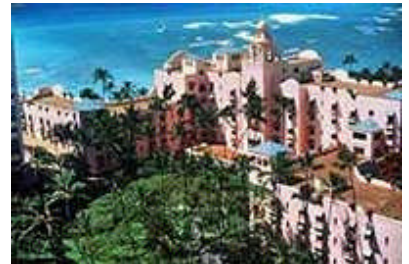
Sheraton Royal Hawaiian Hotel