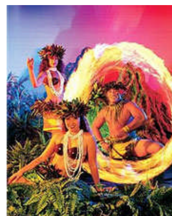
Hawaiian art performance