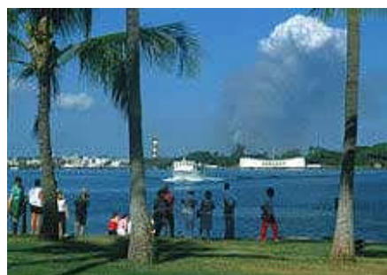
Arizona Memorial in Pearl Harbor

http://www.wanderplanet.com/oahu-island-travel-vacation-hotel-reservations/