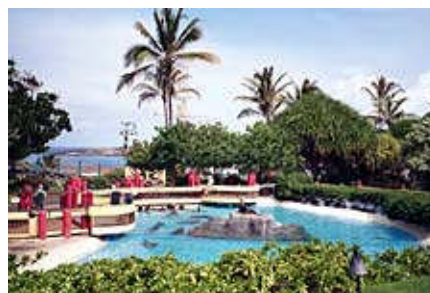
Sea Life Park

Beside these parks there are gardens and waterfalls as well. Manoa Falls is situated not far from Honolulu. Waimea Falls Park is located off the Kamehameha Highway.